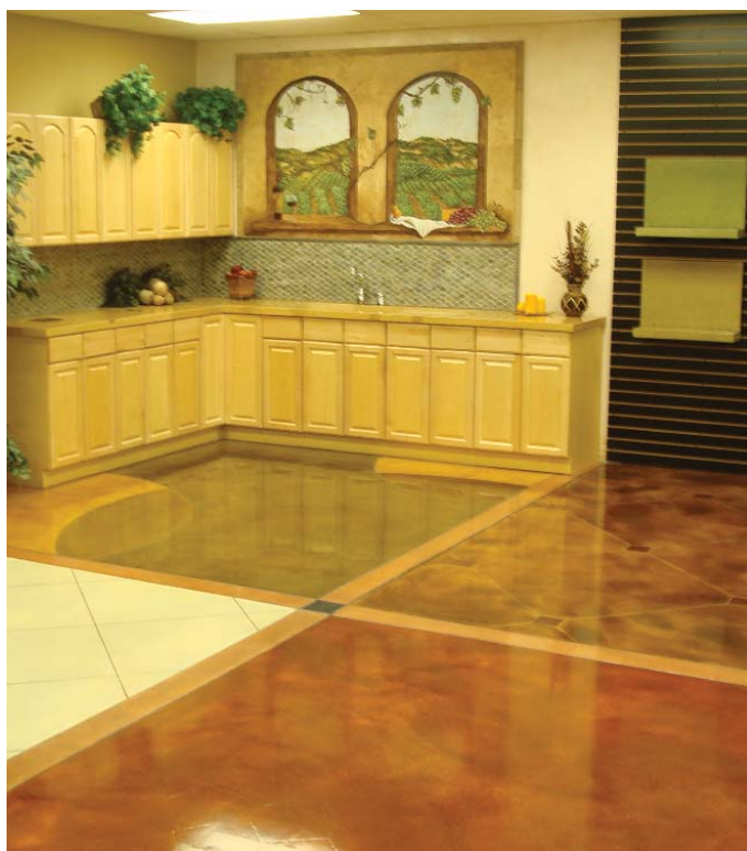
The Expo Design Center vendor Western Floor Decorating, Inc. offers flooring products suitable for the green industry.

Engaging consumers at the point of interest where products can be showcased is the surest way to learn about the prospective customer's preferences, establish dialogue, acquire prospects at point of purchase, and provide incentives to drive them back to retailer's location. This seems like a brilliant strategy for the retailer to pursue.